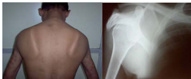
Fig 3. Winging of scapula due to deltoid contracture. Fig 4. Radiograph of shoulder joint was normal

so around the hips and shoulders (Fig 2). He had bilateral winging of scapula (Fig 3) and indurations of the deltoids, biceps, glutei, quadriceps, and gastro-soleus. Range of motion, which were abnormal, were as follows: bilateral shoulder abduction 35°-180°, right elbow flexion 0°-55°, left elbow flexion 0°-65°, right hip flexion 0°-45°, and left hip flexion 0°- 50°. Terminal flexion was mildly restricted in bilateral knees. Ankle flexion and dorsiflexion were restricted on both sides allowing a range of motion of around 25°. Distal joints were normal. Muscle power was normal. There was a mild sensory deficit in bilateral foot (stocking pattern).